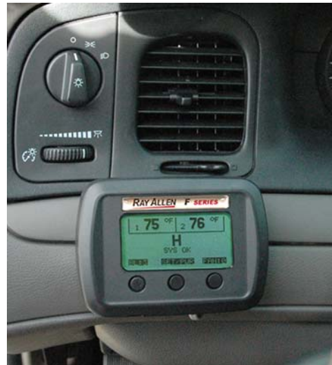
On facing of dashboard.

NOTE: WE CANNOT STRESS STRONGLY ENOUGH THAT THE INTENDED USER BE INVOLVED IN THE DECISION ON THE LOCATION OF THE HUD UNIT.