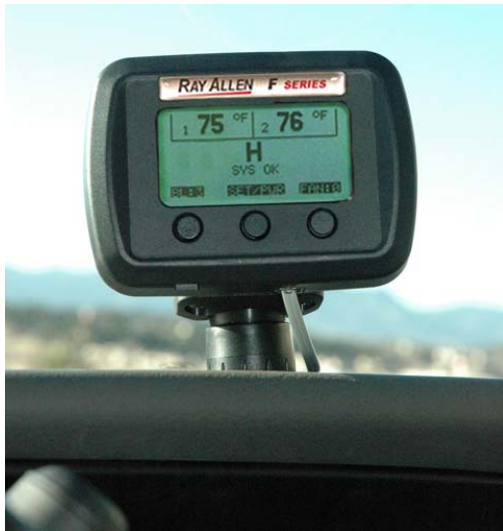
On top of dashboard.